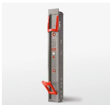
All control elements relevant to passenger safety are integrated into one device.

A defect door must be able to be locked independently from the door drive. For this, a door locking device module has been integrated in the case described here. A bolt (which is to be operated via a detachable key) is connected to a Bowden cable. The disabling of the door is carried out using this Bowden cable.