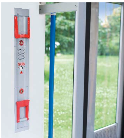
The installation place is beside the door

Modules can be omitted or additional modules can be inserted depending on the project. Alternatively, a loud-speaker module is available in addition to the emergency intercom.